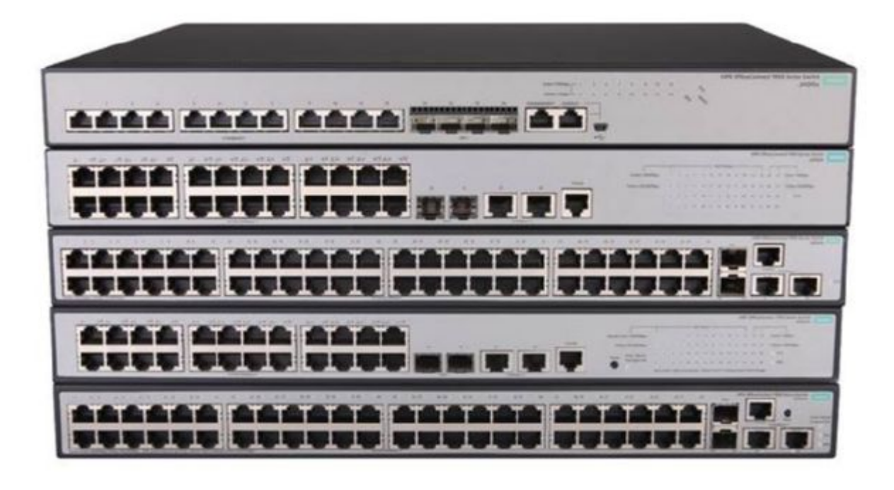
HPE OfficeConnect 1950 Switch Series

The HPE OfficeConnect 1950 Switch Series has an intuitive Web-based interface for simple customization of network operation. It supports true-stacking, the aggregation switch supporting up to two devices, while the access switches allowing up to four devices, to be logically administered as a single entity, simplifying administration while supporting greater network redundancy. Models support both rack mounting and desktop operation. These switches have IPv4 and IPv6 operation, with Layer 2 switching as well as Layer 3 static routing. Other features include: link aggregation to boost link performance; VLANs, Access Control Lists, and 802.1X network login for enhanced security; and three versions of Spanning Tree Protocol (STP) for added network resiliency. HPE OfficeConnect 1950 Switch Series is covered by a Limited Lifetime Warranty.