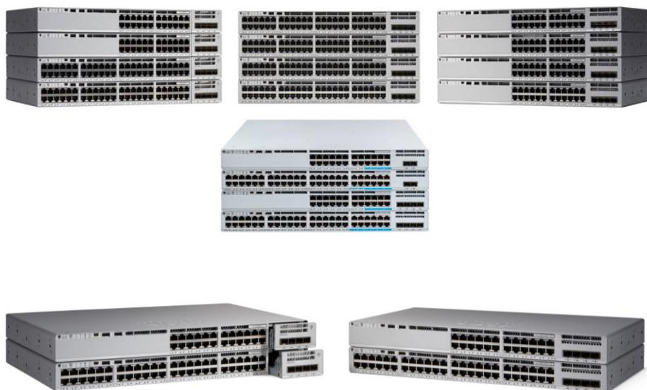
Figure 1. Cisco Catalyst 9200 Series switches

The Cisco Catalyst 9200 Series is made up of modular (C9200) and fixed (C9200L) switch models.